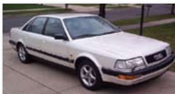
Vehicles for Charity

Need to remove an old car from your driveway?