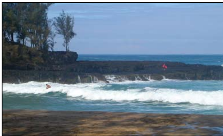
Surf at Poipu Beach Park