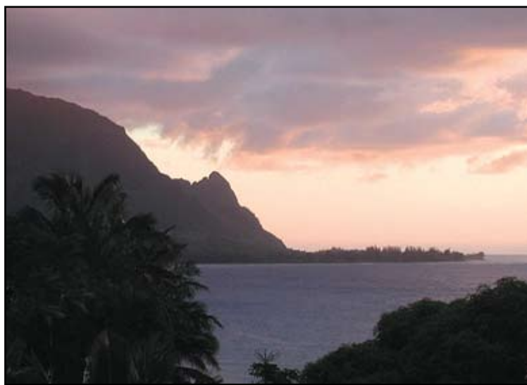
Hanalei Bay sunset